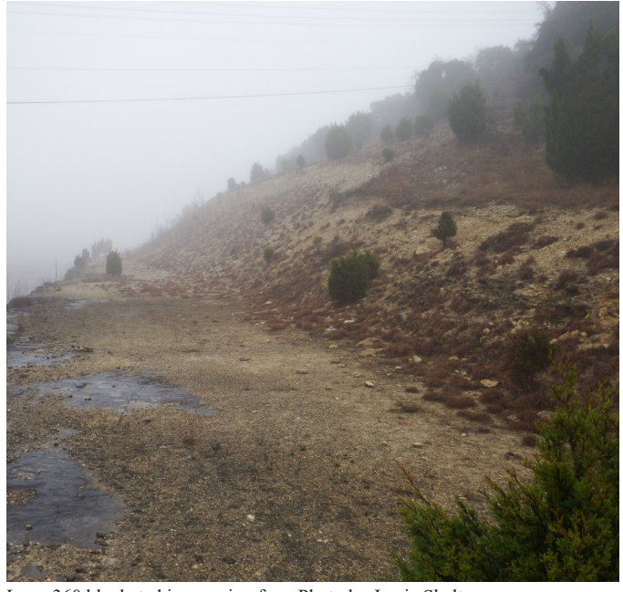
Loop 360 blanketed in morning fog.