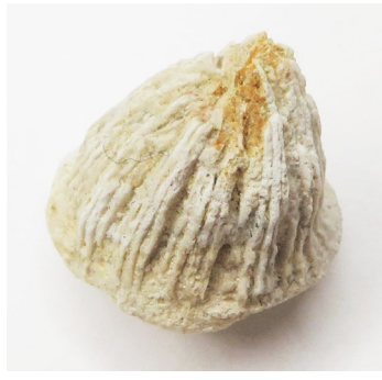
fig 2: Parasamilia coral found by Jamie Shelton