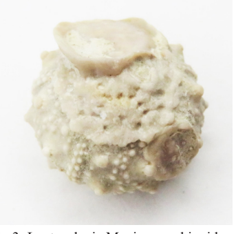
fig 3: Leptosalenia Mexicana echinoid test found by Jamie Shelton