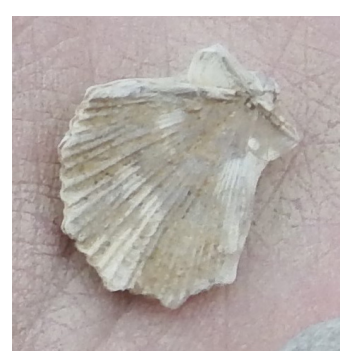
fig 4: Neithia bivalve found by Lily