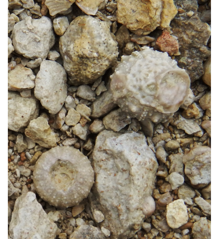
Echinoids in situ basking in the fog!