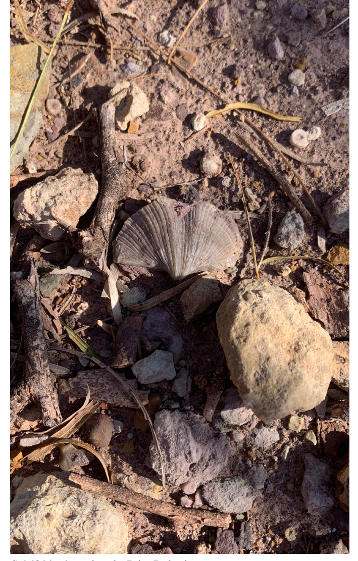
Spirifid in situ