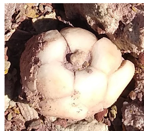
Fig. 3 Crinoid Calyx Found by Jamie Shelton