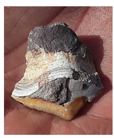
Fig. 2 Petalodus shark tooth Found by Gary Kendrick