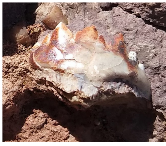
Fig. 1 Peripristis shark tooth Found by Kevin Bills