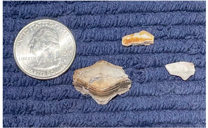
Fig. 3 Petalodus sp. + other teeth (Wayne Mandrell)