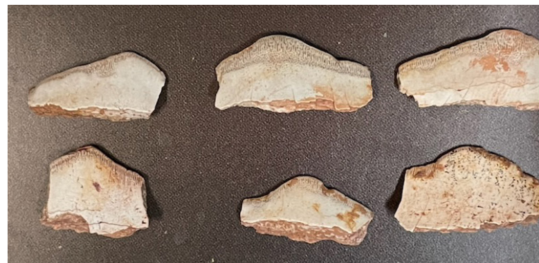
Fig. 2 Petalodus sp. teeth fragments (Carmsen Shubert)

We explored the Santa Anna site thoroughly, hoping to find some trilobites, but alas, none were found except one tiny and not very well preserved one. We all found some nice little brachiopods – Composita , Wellerella , and Neospirifers – plus