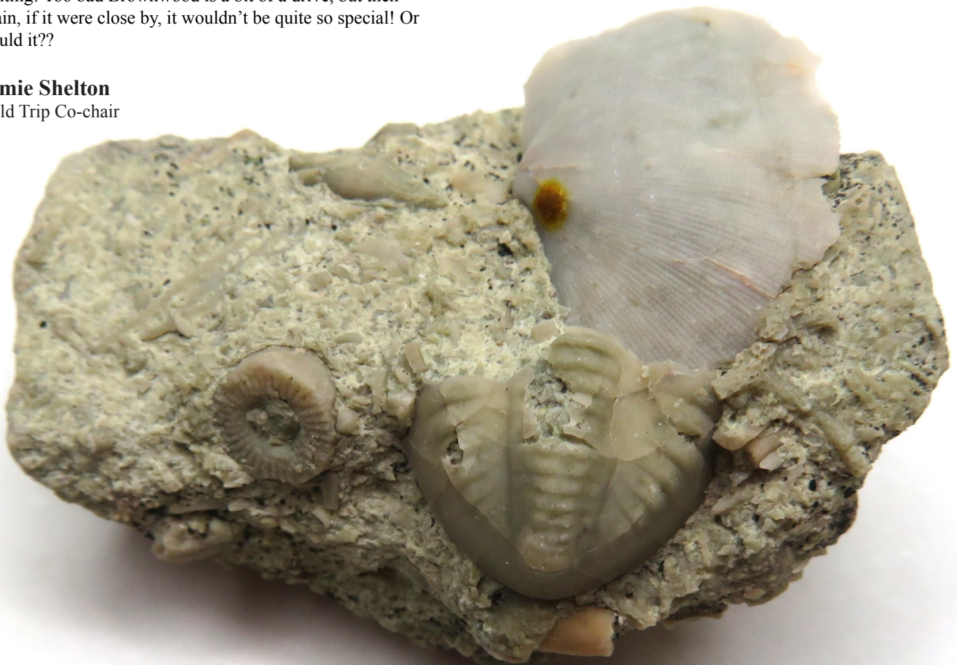
Fig. 4 Ditomopyge sp. pygidium (Jamie Shelton)